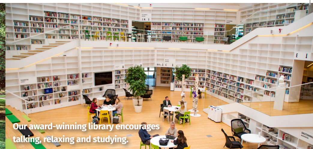
Our award-winning library encourages talking, relaxing and studying.