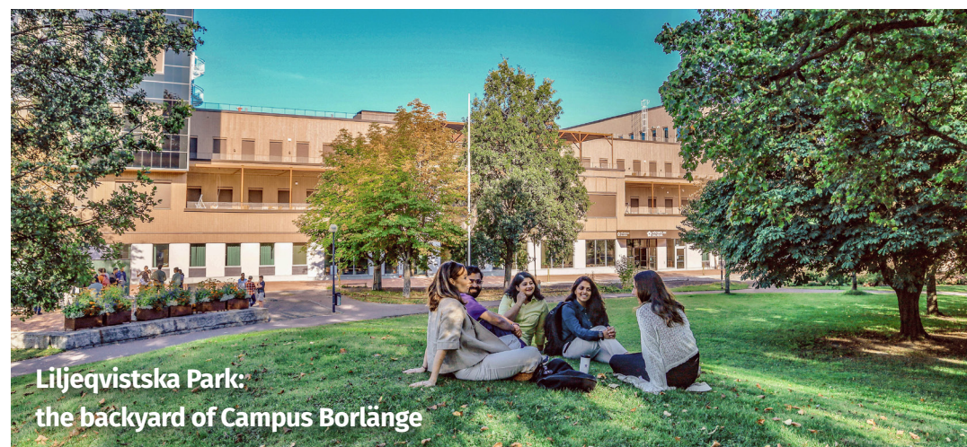
Liljeqvistska Park: the backyard of Campus Borlänge